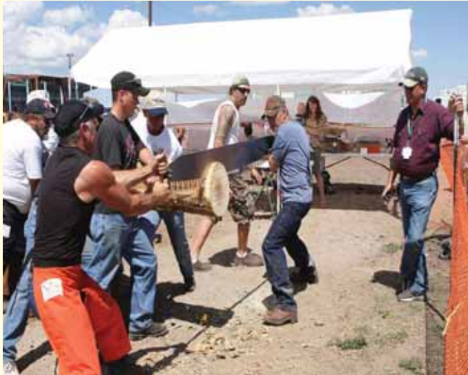
Eagar Daze

Four Seasons highlight the quality of life that is experienced in the Town of Eagar . Whether it's the winter skiing, fall colors, warm spring weather, or cool summer nights, the Town of Eagar serves as a central point to the region's recreational opportunities.