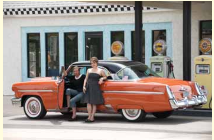
Car Cruz-In, 1950s Car Cruz-In

Added to Cottonwood's appeal are: the newly renovated Old Town Center for the Arts featuring guest sounds of top notch talent such as R. Carlos Nakai, F-Stop Restaurant's world fusion cuisine now offers Friday and Saturday Dinners A La Carte or Prix Fixe, Crema with fresh gelato, now serves meals and music too, the Old Town Jail's upcoming renovation may possibly house the Verde Valley Wine Consortium, and there's a new Self-Guided Walking History Tour compiled by The Cottonwood Hotel. Other music venues include Bear's Earth Gallery, Heart and Soul, Kactus Kate's, The Green Garden, and, spontaneously, other