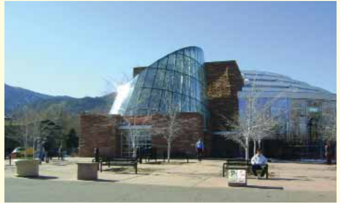
Boulder Public Library

Overflowing with bookstores, art galleries, coffeehouses and street performers, the Pearl Street Mall is a pedestrian-only outdoor