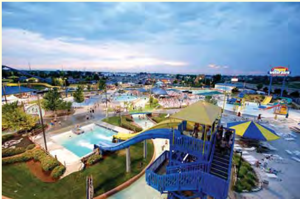
Roaring Springs Water Park

Roaring Springs is located five miles west of Boise, at I-84, exit 44, Meridian, right next door to Wahooz Family Fun Zone . Combo tickets available in summer. Visit www.roaringsprings.com