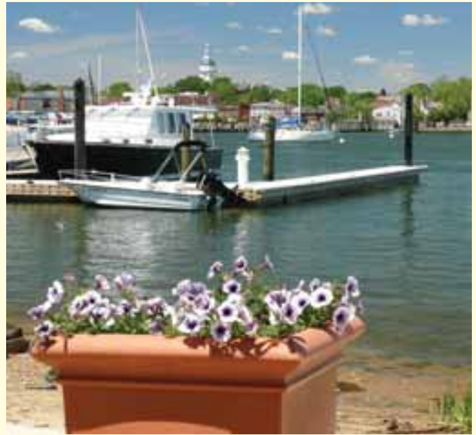
Annapolis

Forever evolving, the shopping experience in Annapolis and Anne Arundel County is an attraction in itself. Ranked among the top three shopping attractions in the nation by U.S. Family Travel