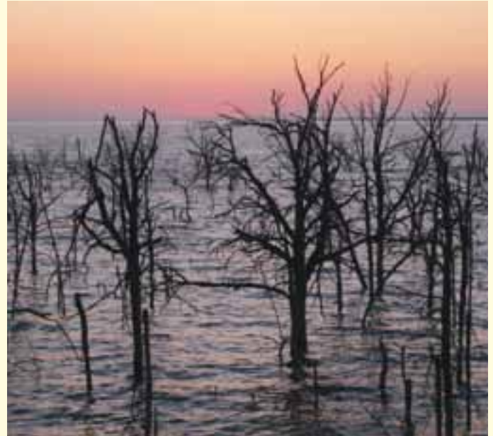
Devils Lake

you'll find the great city of Minnewaukan . Because Minnewaukan is away from the larger city you can sit back and enjoy nature at its finest. On the southwest side, Warwick offers great camping.