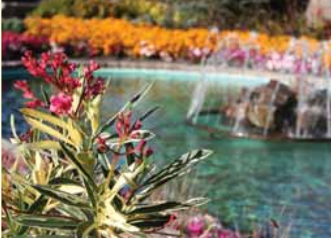
Formal Area Fountain

over 155,000 flowers in displays tucked in the terraces and walkways of the garden.