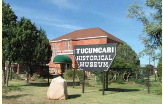
Historical Museum

For more information, please contact the Tucumcari/Quay County Chamber of Commerce at (575) 461-1694.