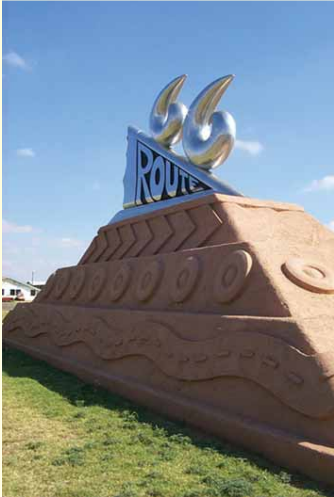
Route 66 Attraction

famous Route 66 Neon Signs. Take a short trip to Ute Lake or Conchas Lake and go picnicking, hiking, boating, swimming, and fishing. Travel along the Scenic Byways to see our beautiful and unique landscapes and a variety of wildlife. Have fun at our con-