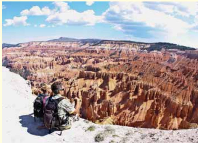
Cedar Breaks National Monument

Draper's newest outdoor water park is Cowabunga Bay Water Park, located at 12047 S. Factory Outlet Dr. This water park not only looks like a fun place to hang out, it is fun for all ages. The park features 1,500 feet of water slides, a 400-ft. lazy river and 300 interactive